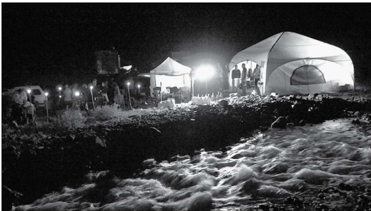
Darkness fell on the Grouse Gulch aid station during the first night of the Hardrock 100 Endurance Race in the San Juan Mountains on July 11.